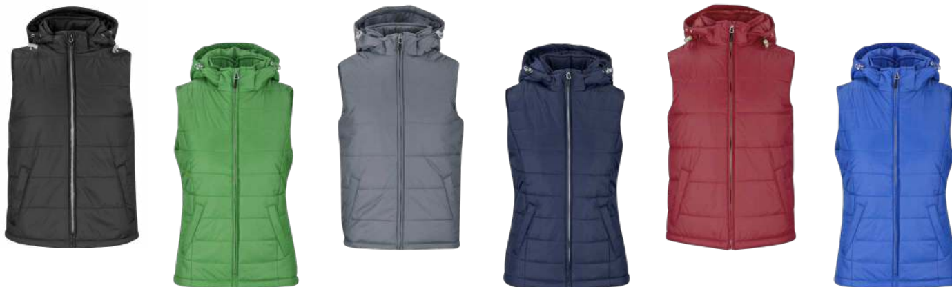
SLAZ-7608 & SLAZ-7609 ARE AVAILABLE IN THE 6 COLOURS SHOWN ON THIS SPREAD