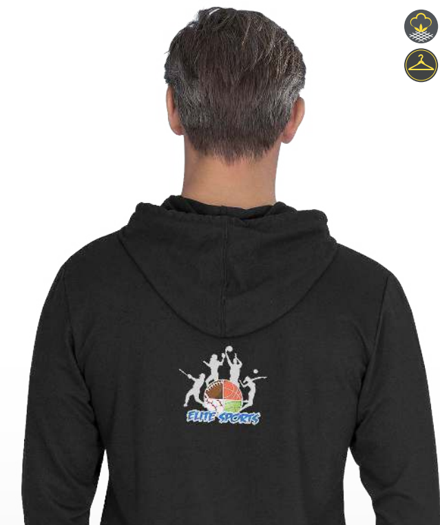
HOOD ON MENS & LADIES SWEATERS

VALUE NEVER GOES OUT OF STYLE WITH THIS lightweight hoodie