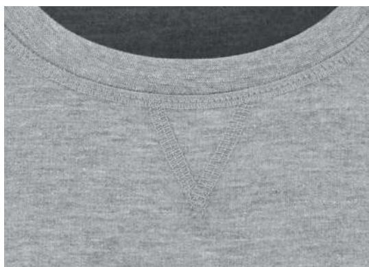
TONE-ON-TONE FASHION V-STITCH DETAIL AT FRONT NECKLINE