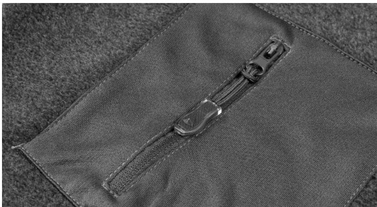
MENS SWEATER WITH ZIP POCKET DETAIL ON SLEEVE