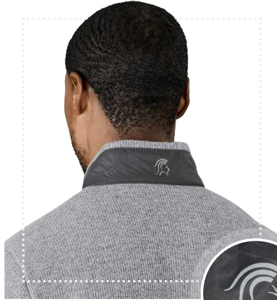
REFLECTIVE BLACK KNIGHT LOGO ON BACK OF COLLAR