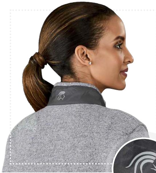
REFLECTIVE BLACK KNIGHT LOGO ON BACK OF COLLAR